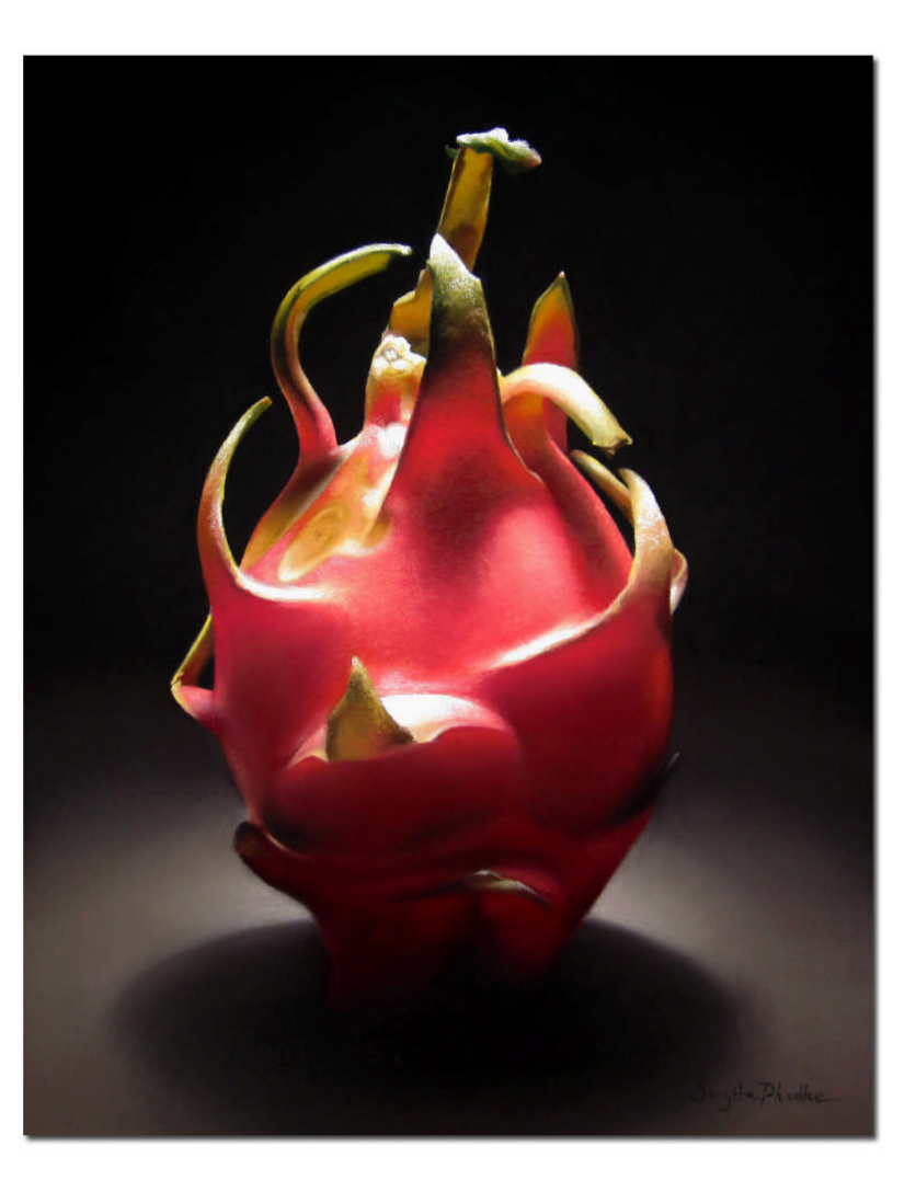
THE DRAGON FRUIT, 11"x14"

The juror of awards stated, "I looked for three things: a high level of craft or technical accomplishment, conceptual substance, and a sense of authenticity reflecting the artist's personal vision."